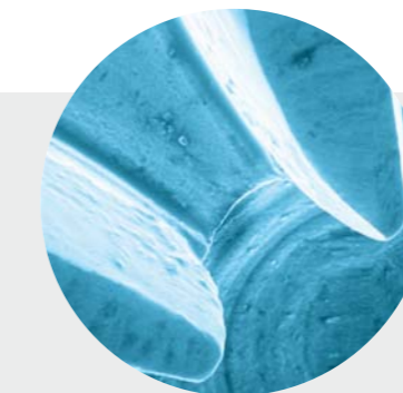
Contra-angle handpiece gearing after Assistina maintenance with rotational lubrication