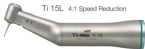
Ti 15L 4:1 Speed Reduction