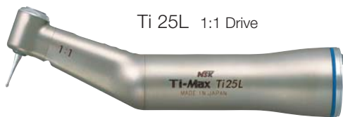
Ti 25L 1:1 Drive