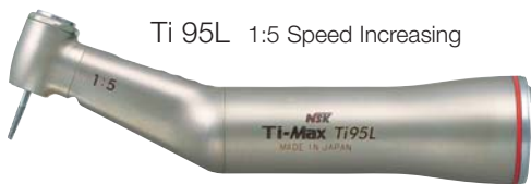
Ti 95L 1:5 Speed Increasing

The advantage of NSK Solid Titanium Ti-Max low speed handpieces is significant. NSK now uses Solid Titanium extensively for the latest low speed handpiece models. Ti-Max series low speed handpieces incorporate a new "slim-line" neck design that allows clear operator vision direct to the operating field while the integrated Cellular Optics provides clear illumination. Connecting NSK Ti-Max low speed handpieces to the Ti 205L optic air motor creates the ideal combination for all low speed procedures. Other brands of low speed optic and non-optic low speed handpieces can also be connected to the NSK Ti 205L air motor.