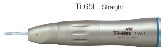
Ti 65L Straight