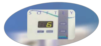
Precise repeatability of the selected time

Softly is entirely made of injection-moulded ABS material. It is in compliance with all electrical and mechanical safety standards.